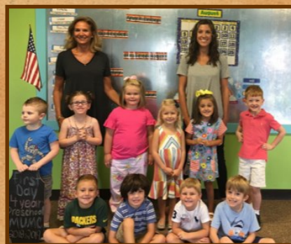
2018-2019 4-year old preschool class

We are so excited to have our new preschoolers on board. We do have a few rare openings in our preschool. If you have a child or know of one that might be interested, please contact the preschool or our church office.