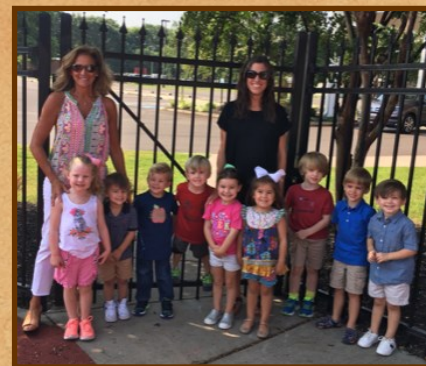
2018-2019 3-year old preschool class