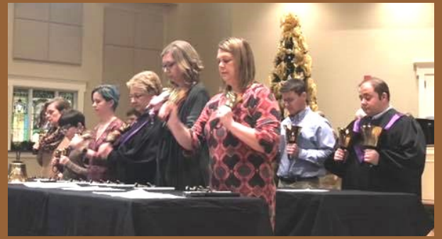
Hand bells ringing "Angels from the Realms of Glory" on Dec 9th.