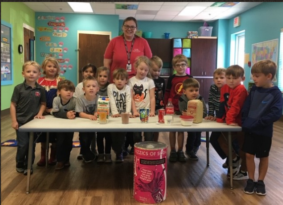
Photo Below: Stop by the children’s area of our church any weekday and you will find classrooms full of young children. With 35 children enrolled in our Parent’s Day Out and Preschool Programs, there is never a dull (or quite) moment throughout the week at MUMC.