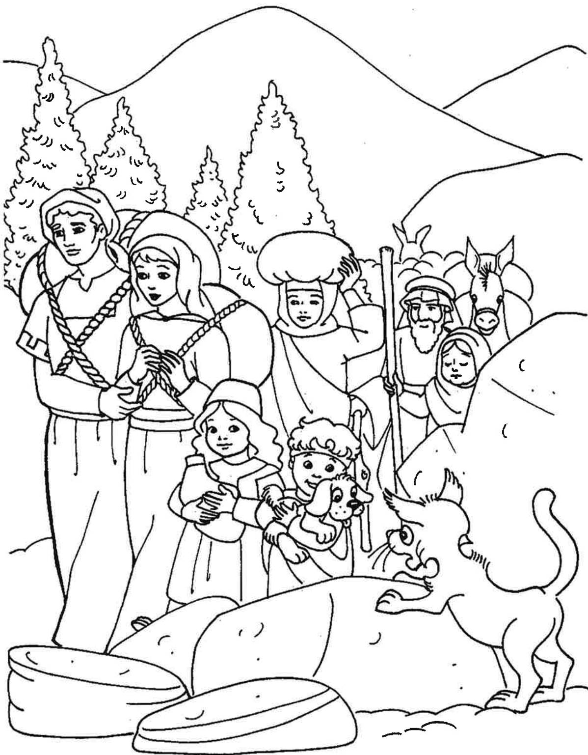
The Israelites hurry out of Egypt towards the Red Sea