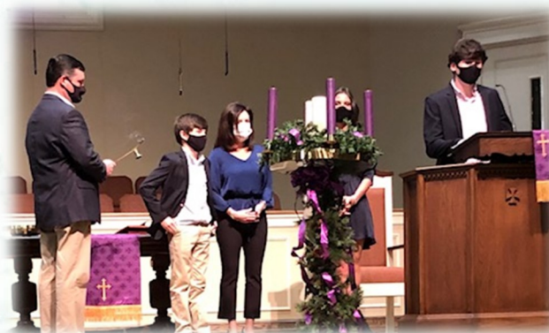
The Collard Family