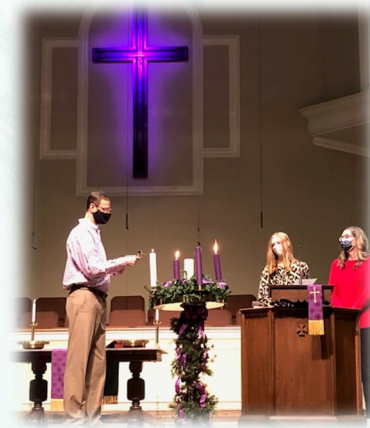
The Wehrum Family