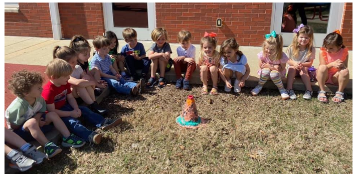
V is for volcano . Learning is always fun at MUMC Preschool and Parent's Day Out