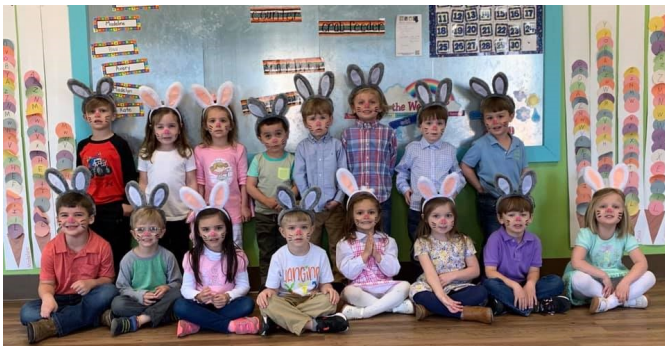
Our 3-yr-old and 4-yr-old preschool classes: Easter fun with the cutest bunnies ever!