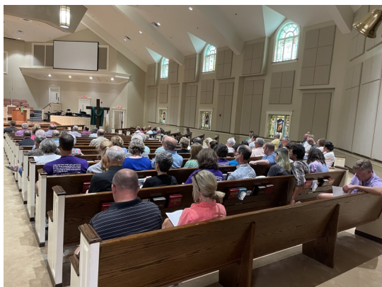
Aug. 27th Vote