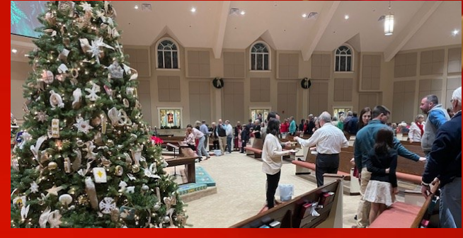
Above: Communion Below: The Coe family preparing for our communion